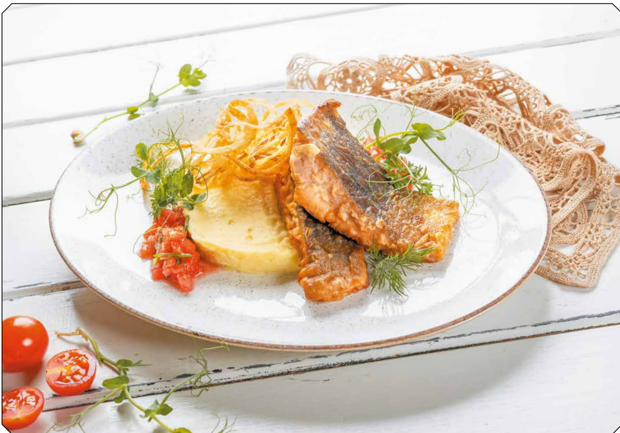
«Fisherman's happiness» FRIED CARP UNTIL GOLDEN CRUST, WITH CRISPY ONIONS, MASHED POTATOES AND TOMATO SAUCE 375.- за 100 g