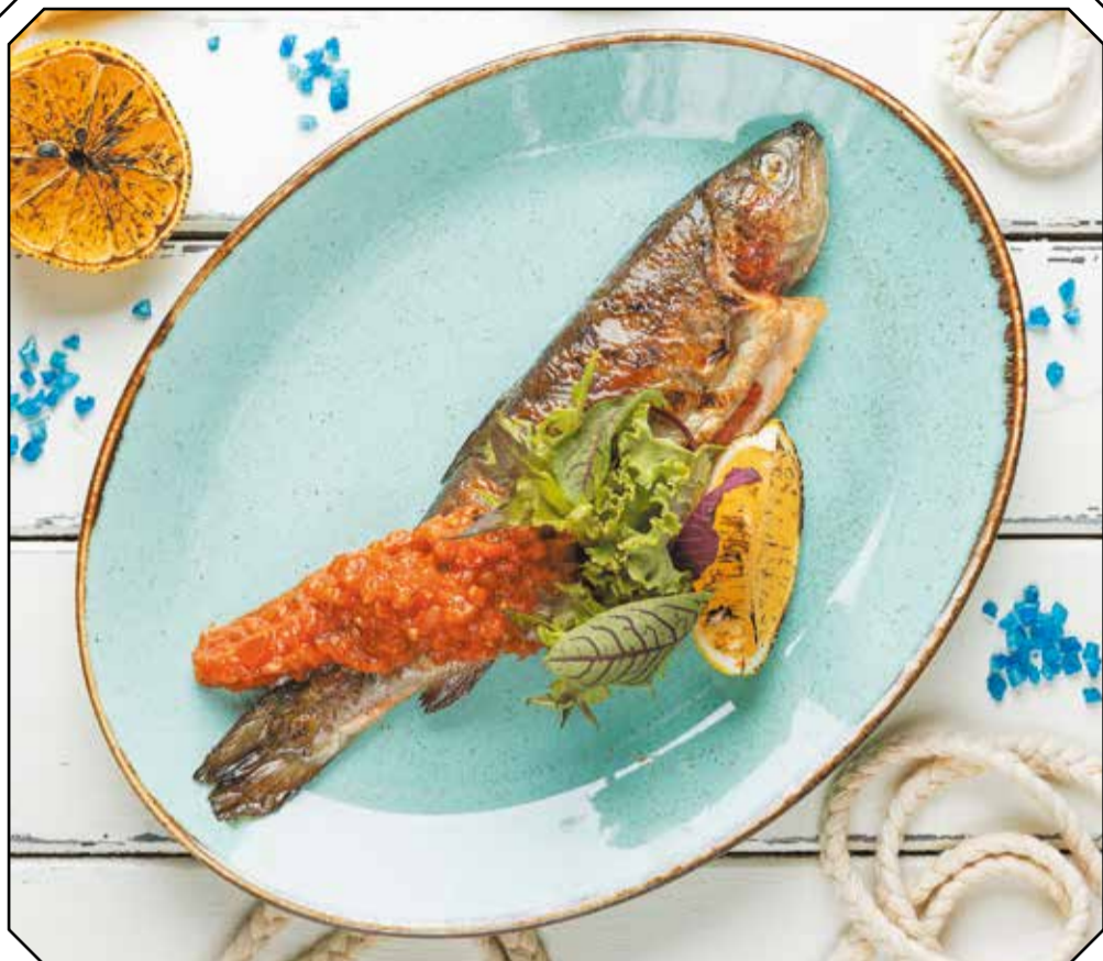
Whole trout GRILLED TROUT WITH TOMATOES AND SPICY HERBS 340.- за 100 g