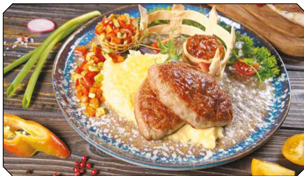
Cutlets «Stanichnye» CUTLETS WITH MASHED POTATOES. SERVED WITH «GRANDMA'S» SAUCE 730.- 400 g