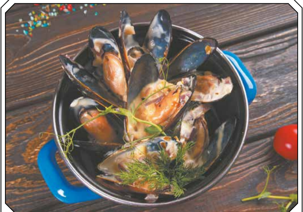
«Fisherman's Chowen» MUSSELS STEWED IN A CREAMY SAUCE WITH A VARIETY OF VEGETABLES 660.- 300 g