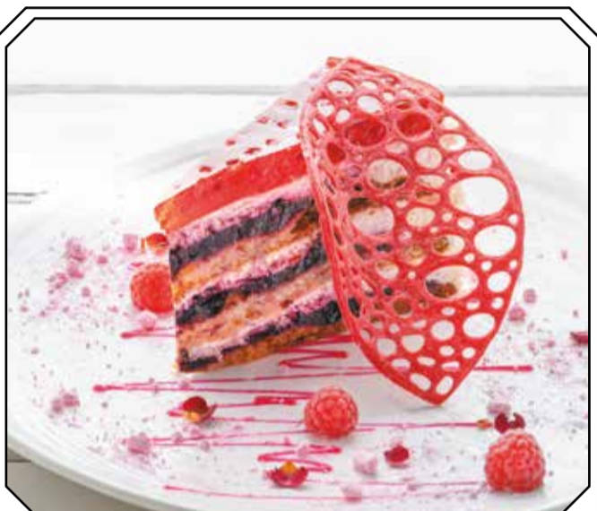
«Smuglyanka» CAKE WITH BLACK CURRANT AND SOUR CREAM-BUTTER CREAM 400.- 180 g