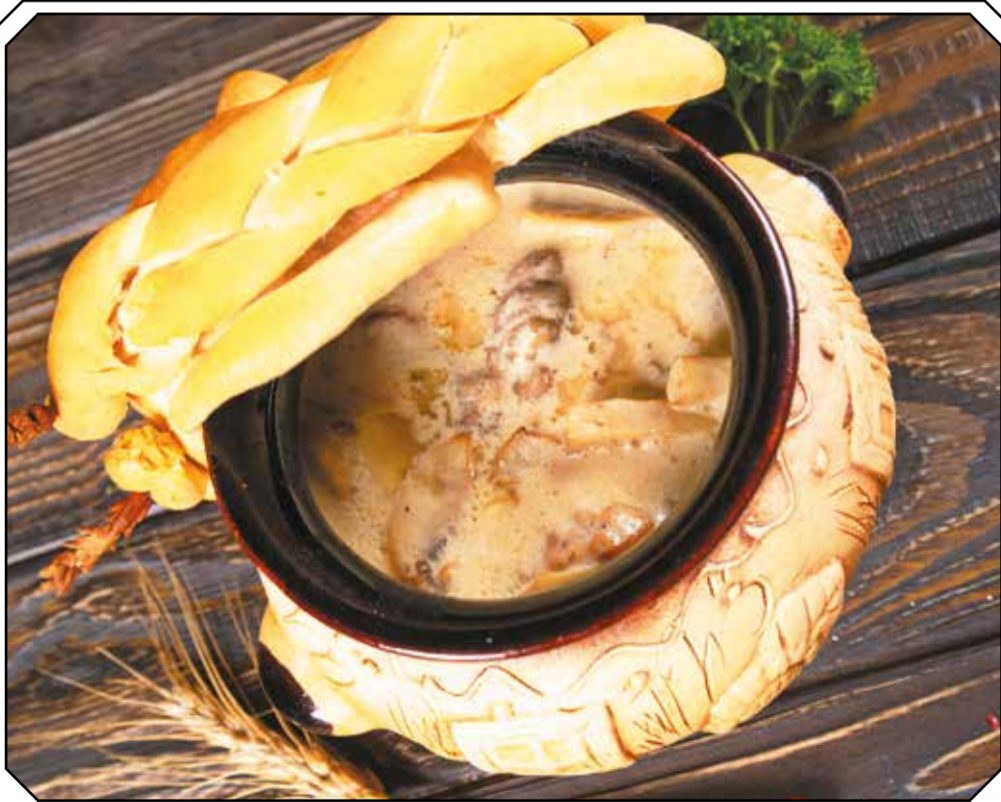
«Playful Rabbit» RABBIT STEWED IN A DELICIOUS SAUCE WITH CHAMPIGNONS UNDER THE DOUGH HAT 830.- 390 g