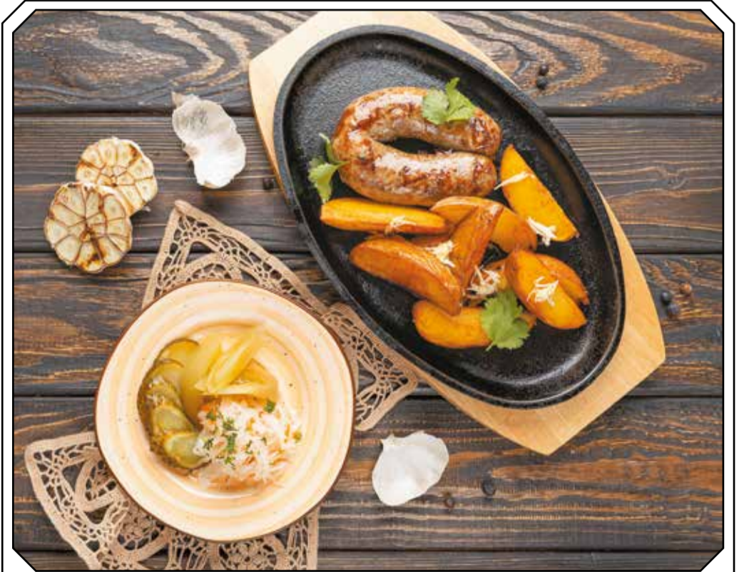
«Pork sausage / Beef sausage» COOKED IN A FRYING PAN, WITH IT, FRIED POTATOES WITH COLILANTOR AND GARLIC 655.- 360 g / 695.- 360 g