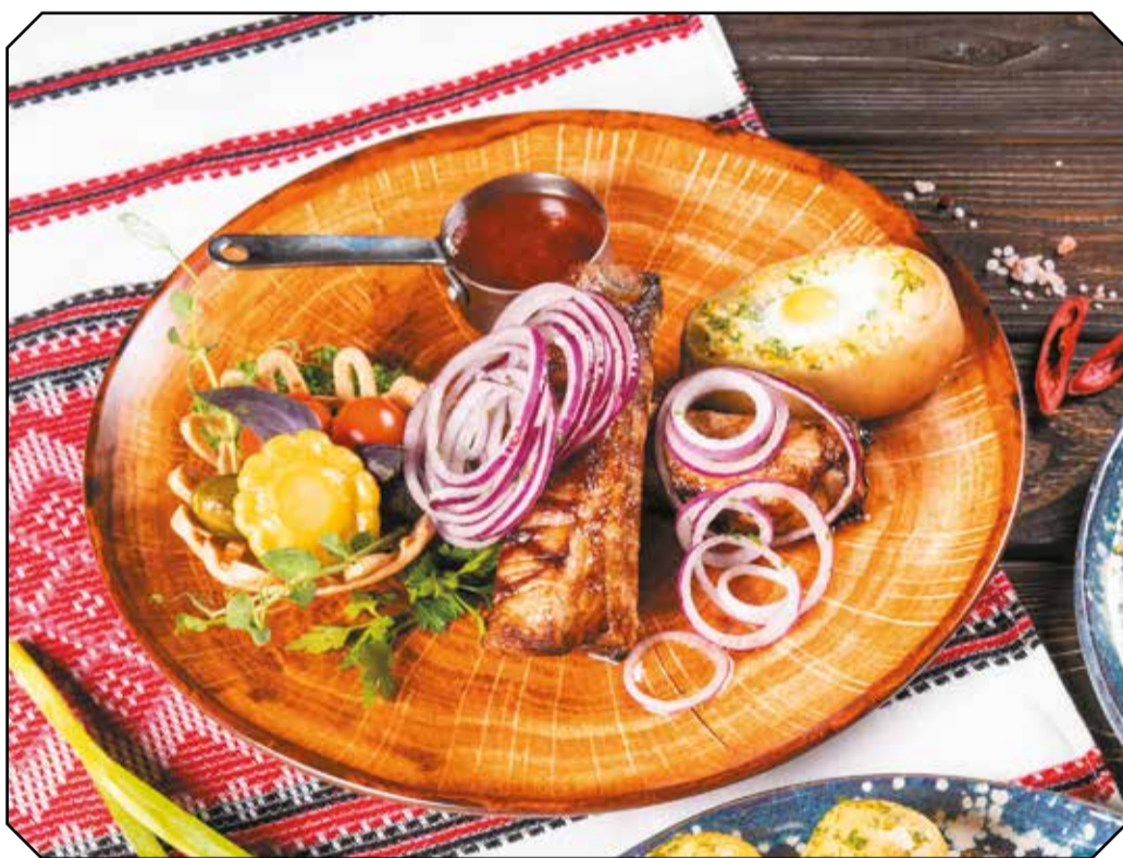
«Yak u babusi» PORK RIBS, GRILLED IN HONEY-SPICY MARINADE, SERVED WITH BAKED POTATOES, ASSORTED PICKLES, PICKLED ONIONS AND SAUCE 420.- for 100 g