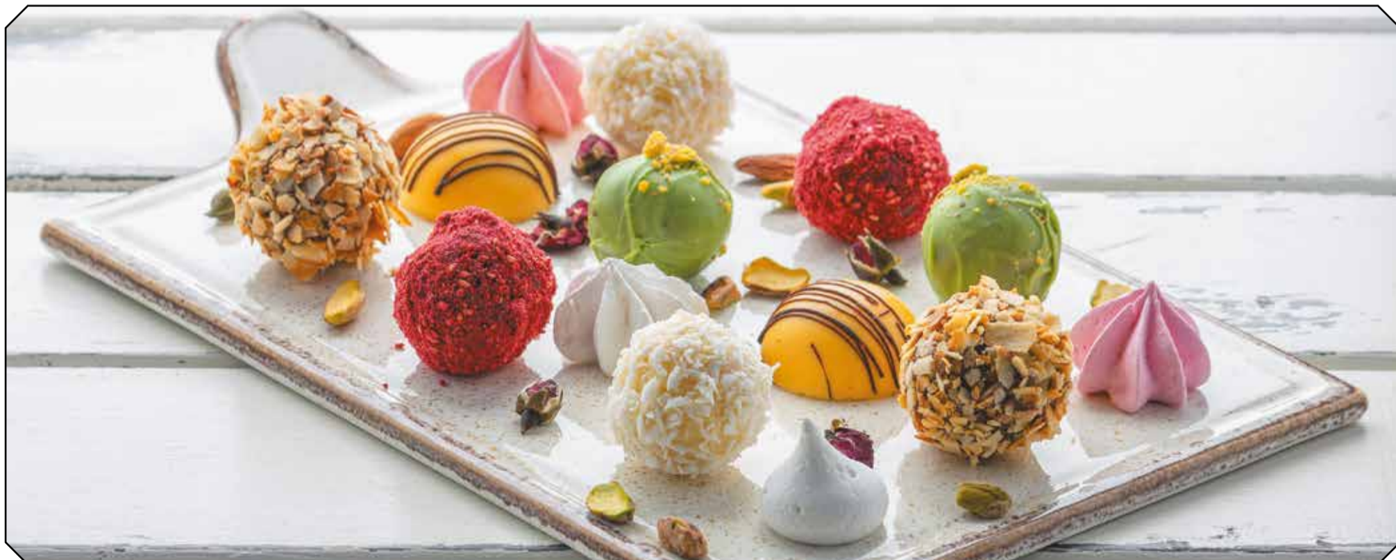
Candies OWN PRODUCTION IN ASSORTMENT 140.- 1 шт.