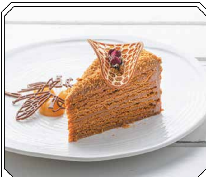
Medovik DELICATE HONEY-BASED CAKES SOAKED IN CARAMEL CREAM 385.- 170 g