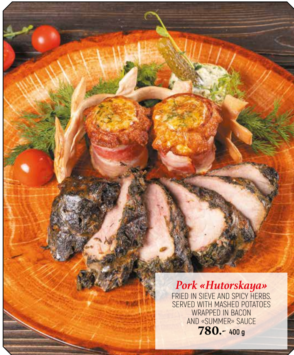
Pork «Hutorskaya» FRIED IN SIEVE AND SPICY HERBS. SERVED WITH MASHED POTATOES WRAPPED IN BACON AND «SUMMER» SAUCE 780.- 400 g