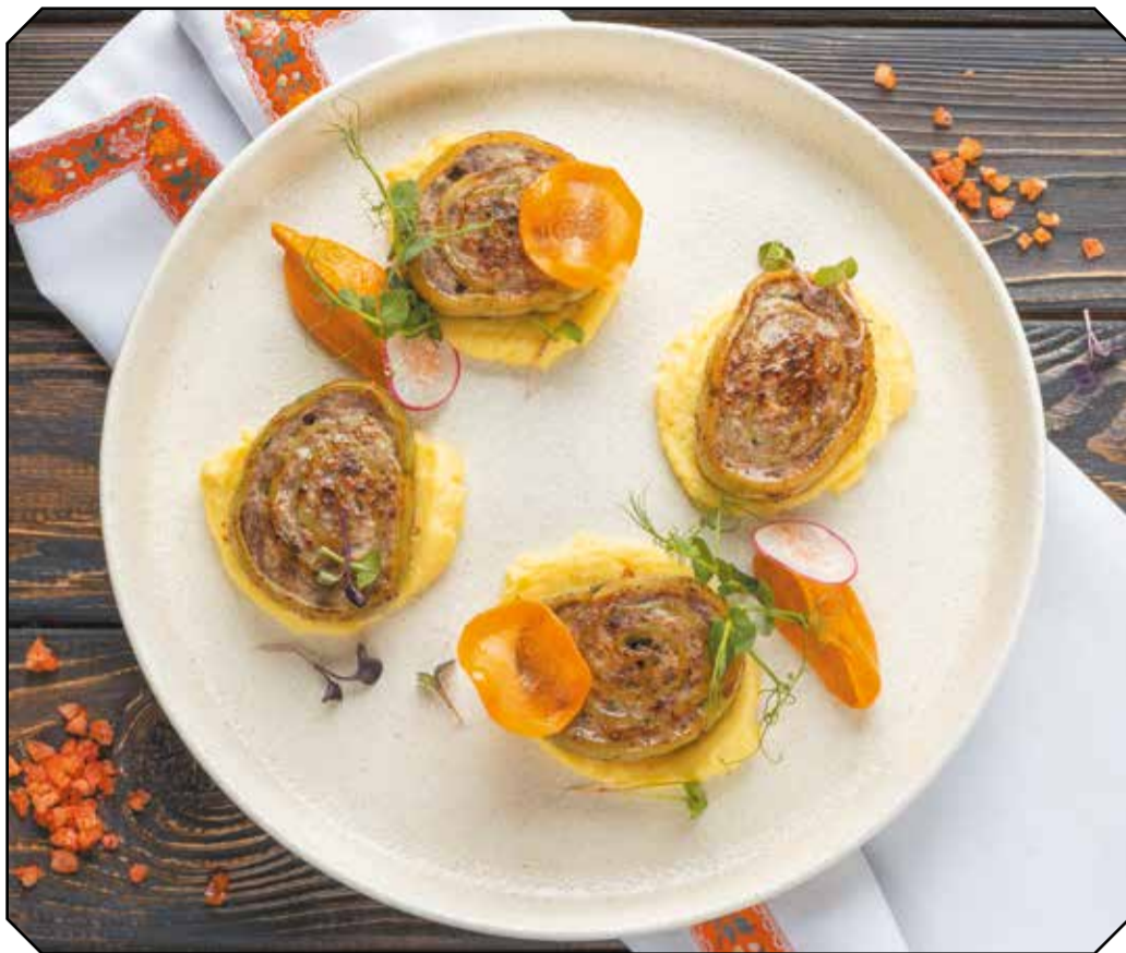
«Kuban Shtrulli» TRADITIONAL COSSACK DISH WITH MINCED MEAT, MASHED POTATOES AND VEGETABLE SAUCE 635.- 365 g