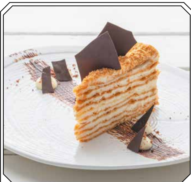
«Napoleon» 395.- 160 g