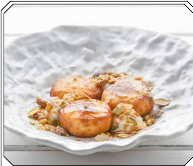
Syrniki WITH SOUR CREAM, SALTED CARAMEL AND NUTS 350.- 200 g