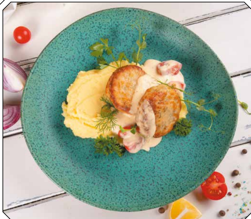
«Po shuchemu veleniyu» PIKE CUTLETS, SERVED WITH MASHED POTATOES AND CREAMY TOMATO 625.- 365 g