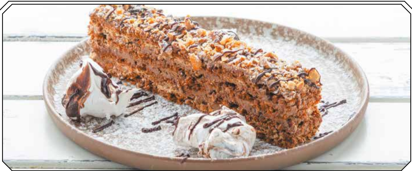
«Nutty» DESSERT WITH HAZELNUTS 350.- 150 g