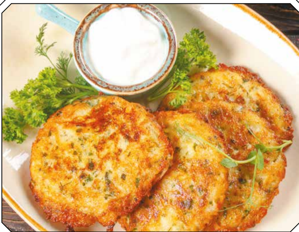
Potato draniki 280.- 210 g